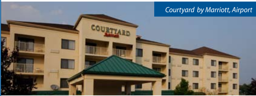
Courtyard by Marriott, Airport