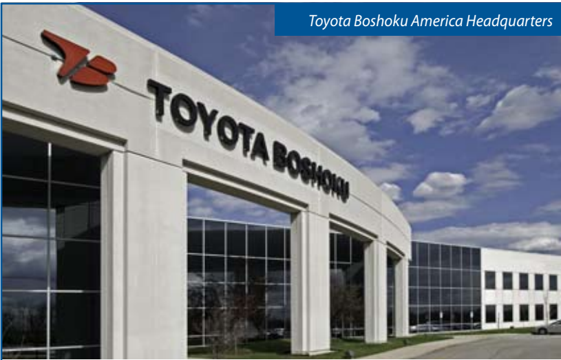
Toyota Boshoku America Headquarters